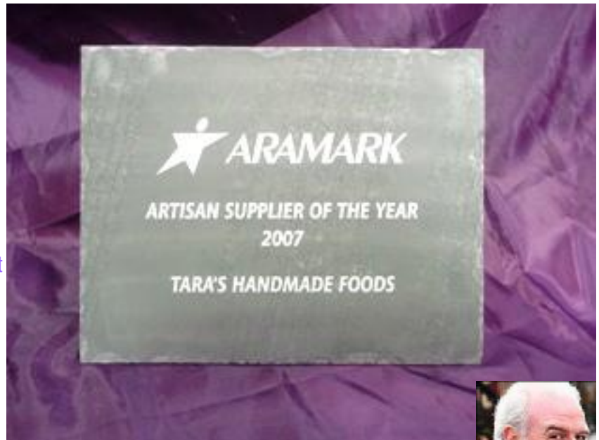
The Artisan Supplier of the year award was presented to Tara's at a ceremony in Dublin hosted by the redoubtable Marty Whelan.